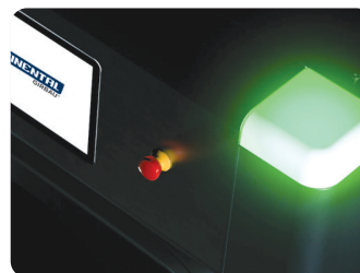
360° VISION LIGHT