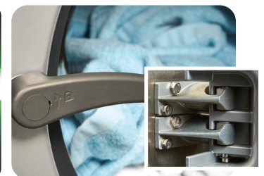
FAIL-SAFE DOOR LOCK & HINGE

Every dry cleaning/fabricare operation is unique, with a distinctive set of production, quality and efficiency goals. Uniquely, Poseidon Wet Cleaning machines deliver the flexibility and programmability to meet any wet cleaning need. The Poseidon team works closely with facilities to properly size and install equipment.