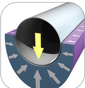
CONSTANT PRESSURE & UNIFORM TEMPERATURE